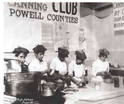
4-H girls, in 1913, demonstrating canning tomatoes.