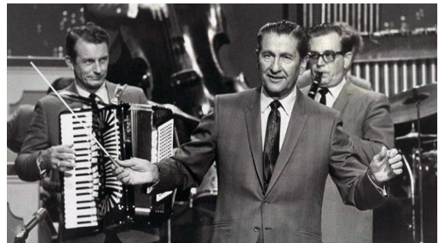
In the 50s though 80s during many National 4-H Weeks, Lawrence Welk paid tribute to 4-H and to the special week being celebrated. Often Myron Floren, the popular accordion player in the orchestra, and a former 4-H'er, would give the tribute and play a special song, or it could just as well be another member of the Welk musical family.

One of the most recent segments added to the National 4-H History Preservation website is the 4-H Promotion and Visibility Compendium. This is a collection of short stories - currently numbering over 170 - highlighting 4-H promotion and visibility over the last century. It includes many truly interesting and inspiring stories with new ones continually being researched and written.