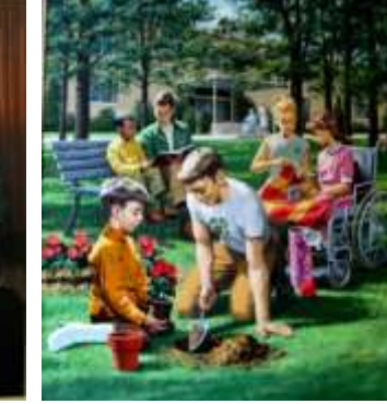
1960s or 1970s