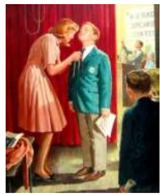
1966 National 4-H Calendar