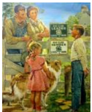
1951 National 4-H Calendar