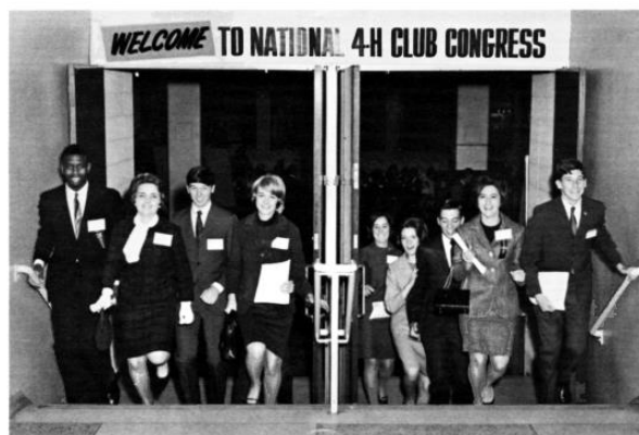
Thousands of 4-H'ers have attended state, regional and national events over the years. Look for them in your family, community or county. They are part of the many "Voices of 4-H History!"