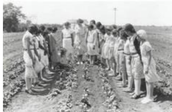
In 1939 agent teaches garden pest control to Latina 4-H'ers in Texas .

March is when spring arrives. For many 4-H members, families and alumni, that means it's time to plan and plant their gardens.