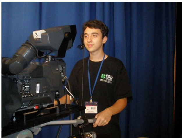
4-H'ers can learn skills in audio- or videotaping and editing as well as interviewing as they help to collect local and state 4-H History for use in 2014.

For more details, please email us at info@4-HHistoryPreservation.com . We'll work with interested volunteers to gather the resources necessary to make the pilot effort a success!