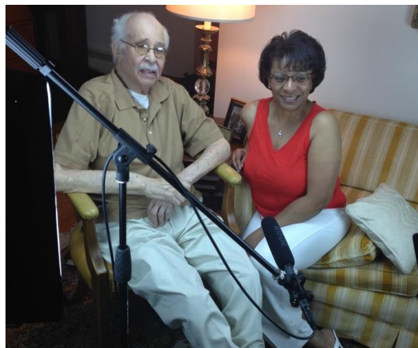
Voices of 4-H alums, leaders and former staff are captured in the homes by 4-H History seekers.

submission deadline is July 1 with $15 registration fee. There is a category just for “Voices of 4-H History” videos. Even better, you can attend this exciting experience in St. Louis on August 3-6 to learn film-making techniques from movie and TV professionals. Learn more about submitting videos or attending the film fest at http://4h.missouri.edu/go/events/filmfest/ (registration information will be posted there soon).