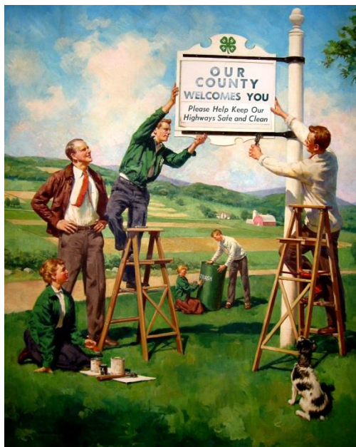
"Keep America Beautiful" was the theme of this 1959 National 4-H calendar produced and sold to 4-H supporters to give as gifts to 4-H members, leaders and to hang in their businesses.