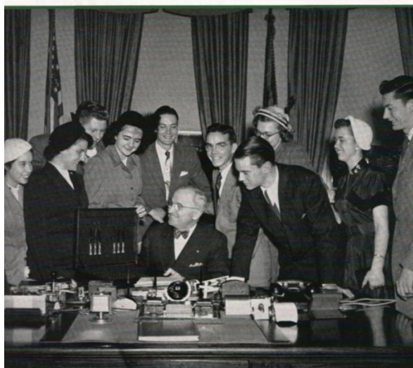
Top 4-H'ers Report to the Nation—See Page 10

Report to the Nation Team meets President Truman in 1951 and the story makes the cover of National 4-H News.