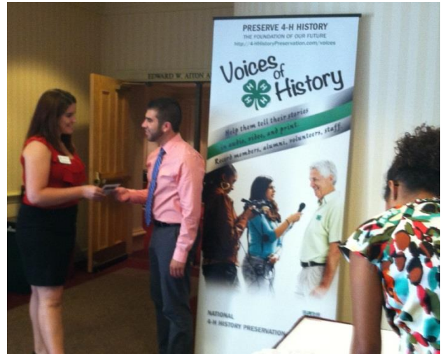
"Voices" banner and educational materials have recently been used to help spread the word about the program at Citizenship Washington Focus (above), Maryland State Fair and Prince Georges County, MD, Fair this summer. See it next at Galaxy IV.

Learn how you can involve communities in celebrating the Smith-Lever Act Centennial. Booth #814 is the National 4-H History Preservation Program exhibit. From 8-12 on Thursday, Poster session 3 at space L-10 features "Voices of Extension History" and space R-18 features "Voices of 4-H History."