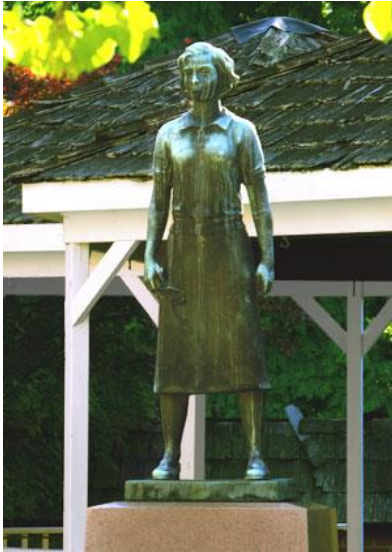
The statue of "the American Farm Girl" as she looks today at the National 4-H Youth Conference Center in Chevy Chase, MD.

September, 2013 Newsletter Volume IV Issue VIII