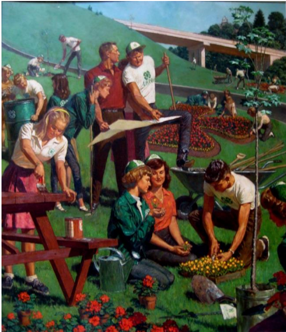
“Plan and Plant for Beauty” was the name given to the 1967 National 4-H Calendar produced by the Shaw-Barton Calendar Company. The original art was given to the National 4-H Club Foundation, (now National 4-H Council) by the calendar company.

Just as the History Preservation Team was in the process of inventorying and documenting the original 4-H Calendar Art at the National 4-H Center we received an e-mail from a 4-H alumnus who was trying to find out the year the calendar was published, for which he and other members of his club had posed in the 1960s. He wanted to tell his grandchildren about the print of the art that he had framed and kept since the ‘60s. Luckily for all of us we were able to tell him the date and he was able to give us information about the “models,” location of the beautification project, and the artist.