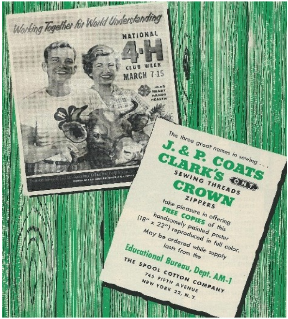
1953 national 4-H poster advert from the National 4-H News.

we do not currently have an image to share with you of the 1951 poster.