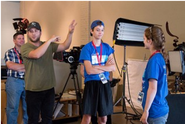
4-H'ers participate in "learn by doing" workshops at FilmFest 4-H.