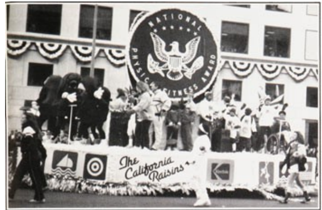
President George H.W. Bush's 1989 Inaugural parade's float by the President's Council on Physical Fitness and Sports featured members of a Washington, D.C. 4-H Club and the California Raisins. The California Raisins was a popular fictional musical group in the late 1980s; 4-H is still popular! (From Winter 1989 National 4-H Council Quarterly)

Everybody loves a parade! 4-H is no exception. At the local level there may be 4-H parades relating to National 4-H Week or the county fair. Community or city parades generated to celebrate the 4th of July, Labor Day, Veterans Day, Flag Day or other events may often have a 4-H float. But historically, 4-H hasn't shied away from some of the bigger events. 4-H has been represented in the Rose Bowl Parade and in the Presidential Inaugural Parade.