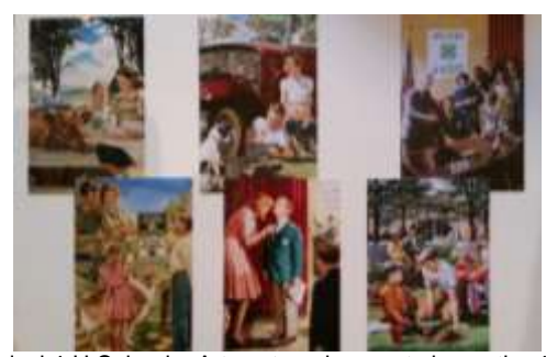
Historical 4-H Calendar Art post cards soon to be on the 4-H Mall.

Many lined up to give donations to receive a set of the six newly-printed historical 4-H calendar art post cards which will soon be available for sale on the 4-H Mall. Others signed up to receive the newsletter and the online News Service, more information about the mapping and oral history projects and to offer historic publications and audio-visual materials for digitizing.