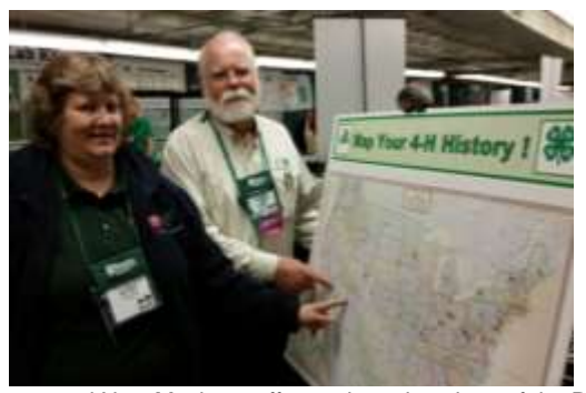
Arizona and New Mexico staffers point to locations of the Points of Interest they have just nominated for the 4-H History Map.

A team of volunteers helped staff both the 4-H History Preservation Program booth and the Esri booth to recruit nominators for the National 4-H History Interactive Map. Nearly a hundred new sites were nominated at the conference by filling out forms and adding green pins for the new Points of Interest on the map in the history booth.