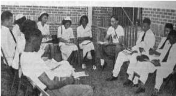
Delegates discuss nutrition and rural health at the first Regional 4-H Camp in 1948.

2015 marks the 125th year of the passage of the Morrell Act of 1890, which established U.S. Congressional authority for the 1890 Land Grant Institutions of Higher Education. Youth development has been an important part of the 1890 mission since the very beginning. 1890 leaders have called for a special effort to document the rich history of the youth development programs and accomplishments based at the 1890 institutions.