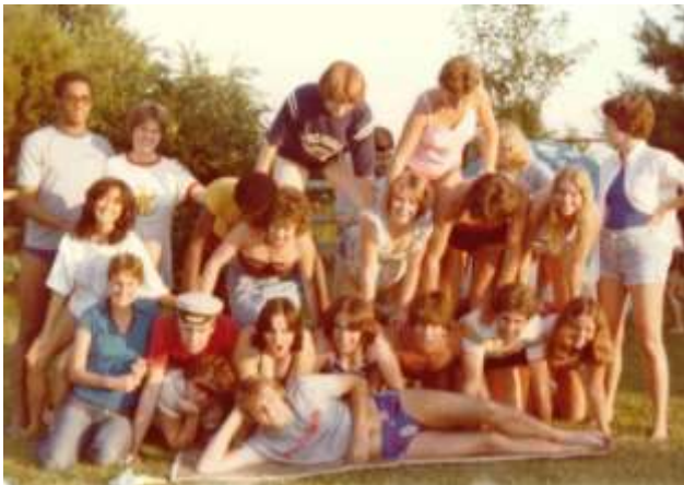
1979 4-H Program Assistants at Citizenship Washington Focus make a human pyramid as part of their team building exercise.

I first returned in 1979 to serve as one of the first Citizenship Washington Focus (CWF) Program Assistants, the year Citizenship Short Course became CWF. By then things had changed. National 4-H Council had been created in 1976 by joining the National 4-H Service Committee with the National 4-H Foundation. Smith Hall had become J. C. Penney Hall, rebuilt with a sizeable gift from J. C. Penney. A new dormitory and conference room complex (Firestone, McCormick, and Kellogg Halls) now comprised the recreated campus; Turner and Warren Halls still stood to the left and right of J.C. Penney Hall as if guards.