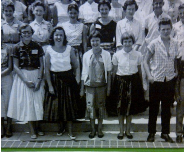
Talbot County's 4-H members at 4-H Club Week at University of Maryland, College Park, MD. 4-H Week was always the first week of August. If you know who any of these people are, write their names on the copy at the left.

One of the items 4-H'ers found to put into the exhibit at their County Historical museum.