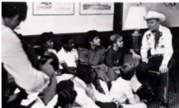
Former 4-H'er Roy Rogers talks to 4-H'ers in one segment of the film, "4-H is More!" (from the Spring 1984 National Council Quarterly).

From its earliest days, US Presidents have been actively involved in 4-H. William Howard Taft, Woodrow Wilson and Warren G. Harding all met with 4-H'ers. President Calvin Coolidge became the first Honorary Chairman of the National Committee on Boys' and Girls' Club Work – a predecessor to National 4-H Council – a tradition that lasted eight decades, president after president, up through William Jefferson Clinton.