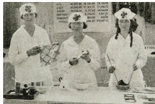
Wisconsin 4-H girls in 1919 demonstrate that dyeing is a practical and economical way to make old clothes look like new.

Clothing and fashion projects have been a part of practically all of 4-H history. From the early 4-H uniforms for boys and girls to the Fashion Revues that are still common today, thousands of 4-H members learned skills in sewing and fashion design and proudly wore the 4-H name and emblem.