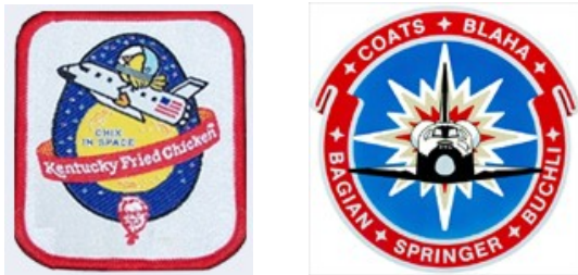
NASA mission patches associated with "Chix in Space"