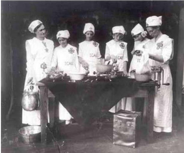
Early girls' canning club.