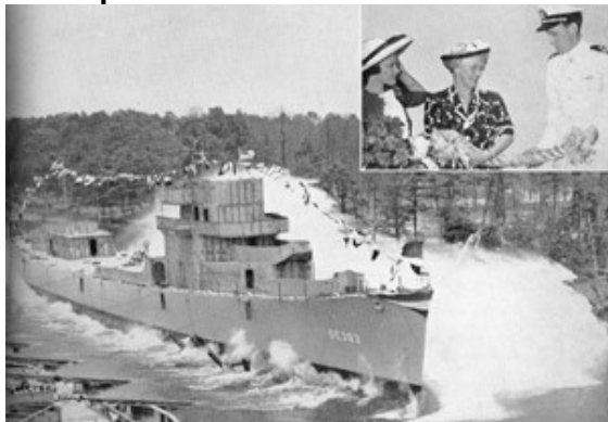
First Navy warship to be named for a 4-H war hero. His mother above center helped with the ship's christening. 4-H members earned the price of about 50 Liberty Ships selling war bonds.

As we all know from the news reports, the bombing of Pearl Harbor and America's entry into World War II happened 75 years ago this past December.