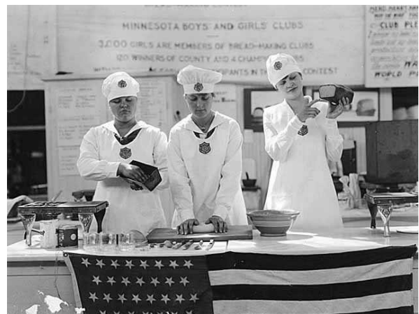
4-H girls demonstrate bread-making at the Minnesota State Fair in 1918.

In the South, membership in boys’ clubs had increased from 95,605 in 1916 to 115,746 in 1917. In addition, 300,000 boys were enrolled as emergency workers who pledged to do something to increase food production. The girls’ canning and poultry clubs increased from 47,620 in 1915 to 73,306 in 1917, with 980,272 more pledged as emergency workers.