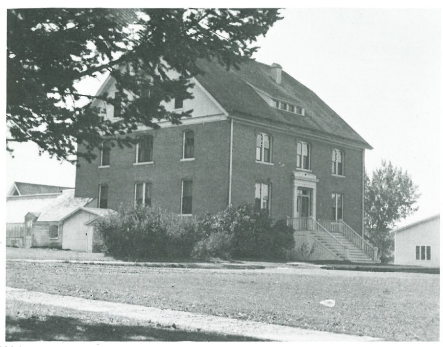
The Extension building. Constructed in 1894.