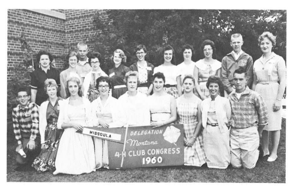
A county delegation to a Montana 4-H Club Congress in Bozeman at Montana State University.

An additional excursion was the annual journey each year of four