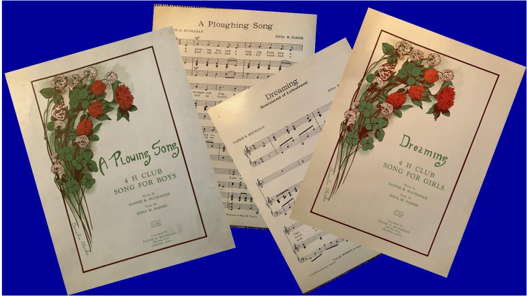
The official Newsletter of the National 4-H History Preservation Team https://4-hhistorypreservation.com/Newsletter/

Drop by and listen to any or all the 4-H songs posted to date. Or just go to the song you want to hear. To listen to "<u>Dreaming</u>" click on the title or go to: <u>https://www.youtube.com/watch?v=XzsqUYvoa4k</u>. To hear the <u>"Plowing Song</u>" click on the title or go to: <u>https://www.youtube.com/watch?v=mq75gScTG4Y</u>.