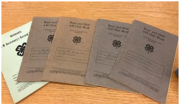
Researching local club records in the library or museum.

staff as presenters when we meet. It meets twice a year and five members of the Vintage 4-H group became the catalyst to create the " Minnesota 4-H History Preservation Team. " We have outlined our goals, established plans of action, met with collaborating organizations and have produced guidelines for discovering and collecting/saving our present and historical 4-H history. Discussions are on-going on who can be our partners to assist us in mobilizing the whole state to join in on saving our Minnesota 4-H history.