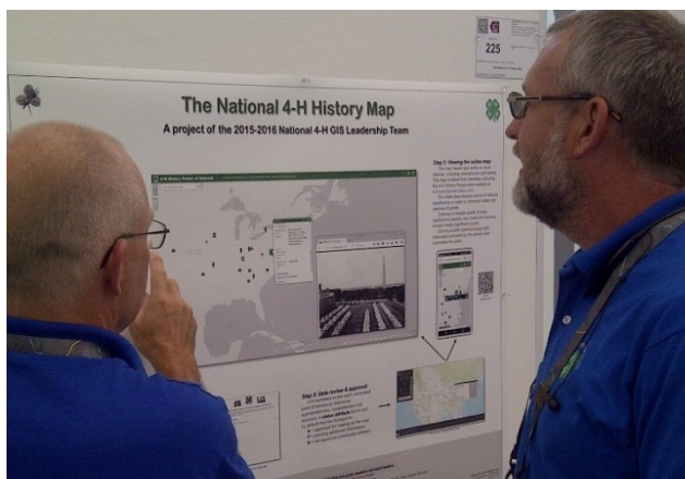
GIS Team Leaders discuss the progress made on developing the National 4-H History Map during the 2016 International mapping conference in San Diego last week.

As many of you know, a group of 4-H map makers and the 4-H History team have been