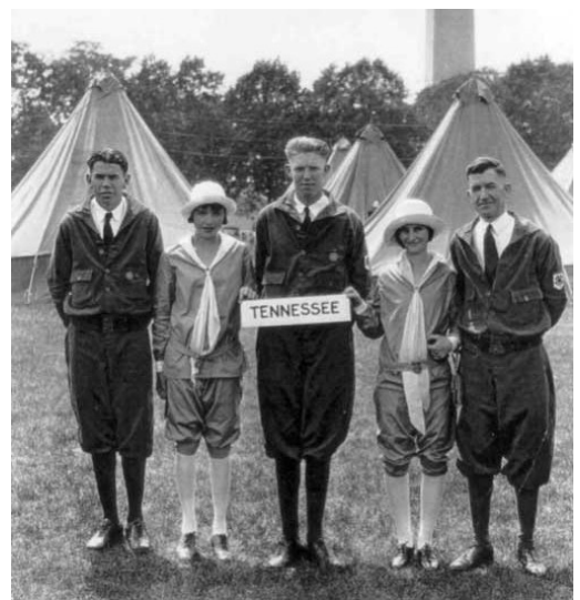
Tennessee Delegates to First National 4-H Camp, 1927.

June 30 , 2009: The National 4-H Heritage Tree, a red oak, is planted on the National 4-H Center campus by charter members of the National 4-H Heritage Club.