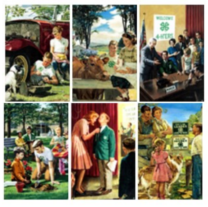
You can buy them from the 4-H Mall at <a href="http://bit.ly/4HPostcards">http://bit.ly/4HPostcards</a>