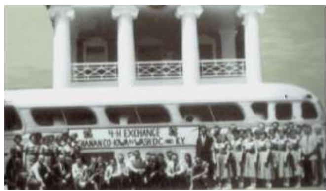
In 1959, Iowa 4-H'ers travelled by bus for an exchange program with Kentucky 4-H. Since the National 4-H Center had just been opened they decided to keep going to see what was there and asked 4-H Center staff to plan a program for them. And the rest, as they say, is history. That trip resulted in the development of Citizenship Short Course (CSC) as it was called until the early 1970s when it was renamed Citizenship Washington Focus (CWF).

The National 4-H History Map/Atlas will continue to grow with your nomination of historical sites in your area. Imagine a cross-country tour hitting 4-H History locations! What better way to learn of 4-H History!