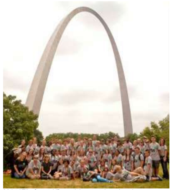
2014 "Filmfest 4-H" participants take a break.

Participants also have the opportunity to have a meeting with the presenters, visiting one-on-one to ask questions and receive personalized advice. Equally exciting is the chance to connect with new friends, who share their technical and artistic interests. "FilmFest 4-H" also features screenings of films made by teen filmmakers, many of whom attend the festival.