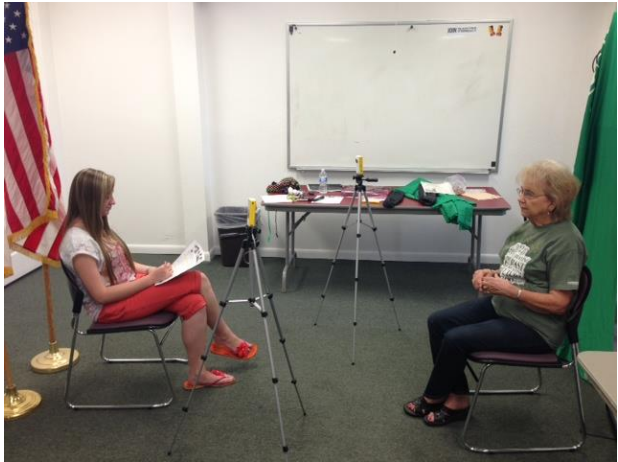
Utah has been testing the use of two cell phones or mini-cameras to video 4-H alumni, leaders and staff about 4-H experiences.

Thanks to 4-H programs across the country that have been conducting "Voices of 4-H History" projects, we are happy to announce the release of the " Voices of 4-H History" Start Up Kit. Summer is the perfect time to launch a project in your club, county, or state! County and state fairs, teen conferences, camps, and visits to relatives who were 4-H members and leaders all provide great opportunities to capture stories that make up the rich history of 4-H.