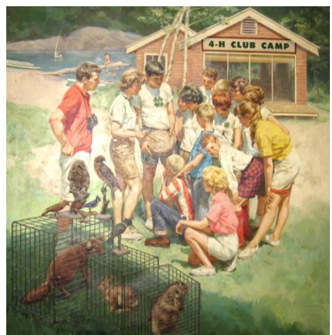
This 1965 National 4-H Calendar painting gives us an idea of activities that were available to members at this camp.

After almost 90 years, historic Camp Seeley in Crestline, CA, a former sawmill and the camp featured in the 1998 Disney movie "The Parent Trap", is still the 4-H camp site for San Bernardino and Los Angeles Counties.