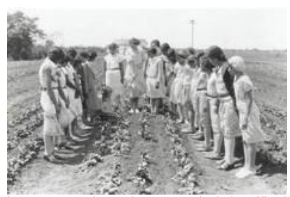
In 1939 agent teaches garden pest control to Latina 4-H'ers in Texas .

March is when spring arrives. For many 4-H members, families and alumni, that means it's time to plan and plant their gardens.