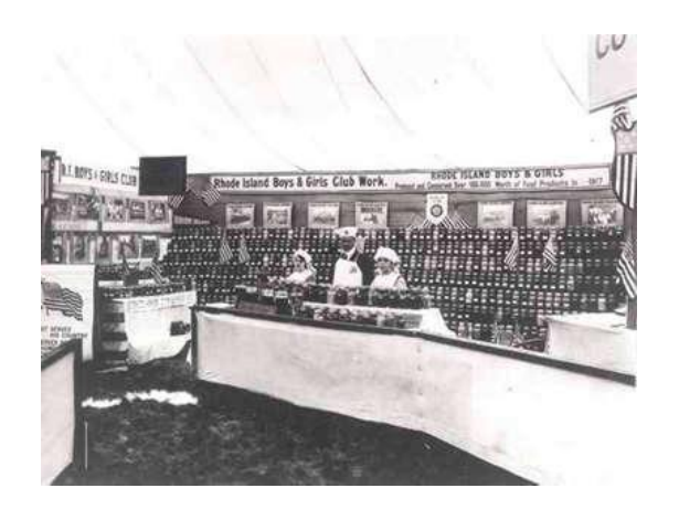
Rhode Island 4-H'ers helped to sustain their families and communities through these canned foods that they exhibited during the World War I

that was essential to the war effort. An estimated 15 million families planted Victory Gardens in 1942, and in 1943 some 20 million gardens produced more than 40 percent of the vegetables grown for that year's fresh vegetable consumption.