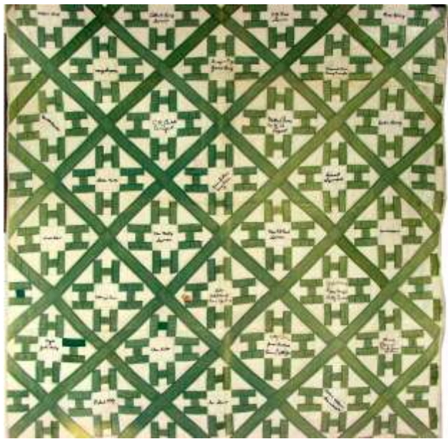
4-H quilt believed to have been made in Tennessee.

We are interested in learning about existing 4-H heritage quilts that have been produced for a specific purpose - Quilts which depict the 4-H history of a club, a community, county, state or a multi-generational 4-H family. Have you seen or helped make a quilt similar to the one below? Have you seen other configurations? We have heard that there are at least four distinctive 4-H quilt designs. Please share what you know with us, our readers and visitors to the 4-H History Preservation Website. You can send a photo and your story about the quilt to: info@4-HHistoryPreservation.com.