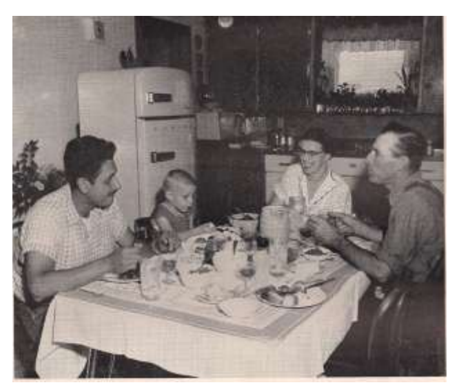
An International Farm Youth Exchangee living and working with a farm family in the US in the 1950s.

Four-H became a global youth movement very shortly after its creation in the US, as 4-H-type youth development programs began springing up around the globe; at its peak, about 103 such organizations flourished in 82 countries outside the US on all continents.