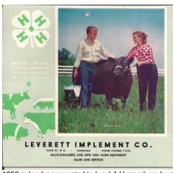
1959 calendar presented to local 4-H members by an Implement company of Mansfield, Ohio.

We would like to digitize the calendars to preserve that important bit of 4-H history. They can be returned to you if you wish. Please e-mail photos or queries to: <a href="mailto:info@4-HHistoryPreservation.com">info@4-HHistoryPreservation.com</a>