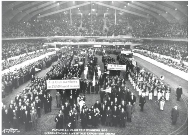
National 4-H Congress Delegates fill the arena as they parade during the 1935 International Livestock Exposition in Chicago.

There probably was no stronger example of public/private partnership than that of the national 4-H awards programs. Dozens of donor corporations provided county medals, state trips and national scholarships as recognition to hundreds of thousands of 4-H members each year. State winners lucky enough to receive a trip to National 4-H Congress in Chicago experienced a celebratory week they would never forget, and national winners appreciated their scholarships as an assist in going to college and launching a career.