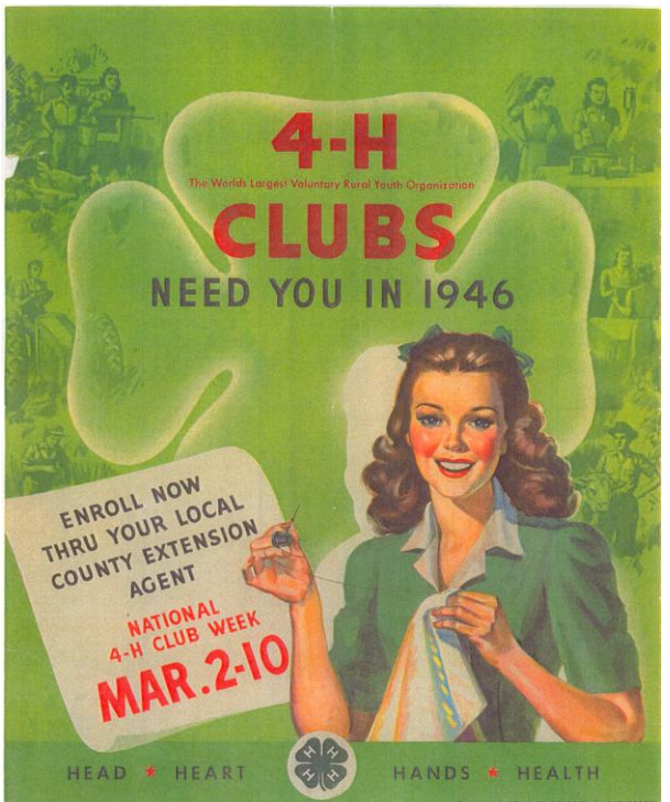
This 1946 National 4-H Poster is the earliest one we have with 4-H week noted on it. National 4-H week began in 1945 as a way to keep membership up after World War II.