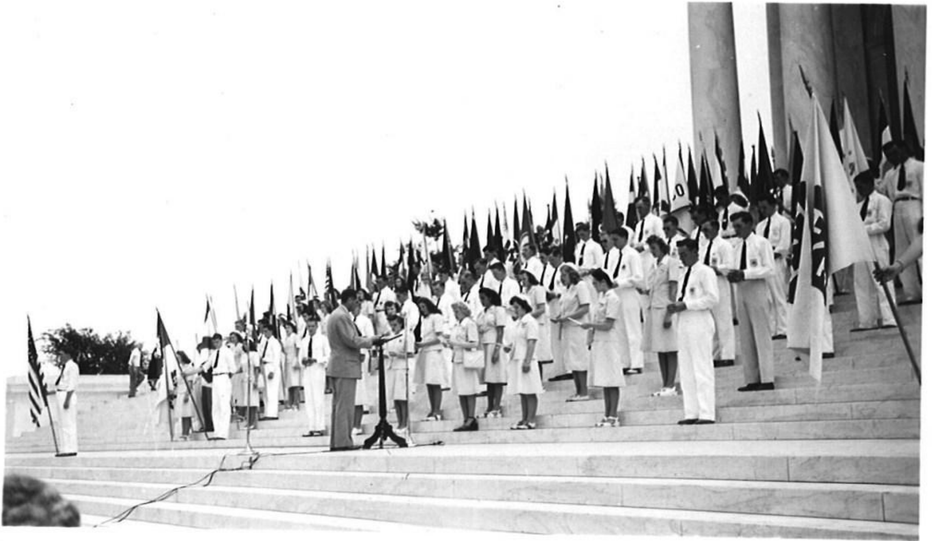
1947 National 4-H Camp Citizenship Ceremony