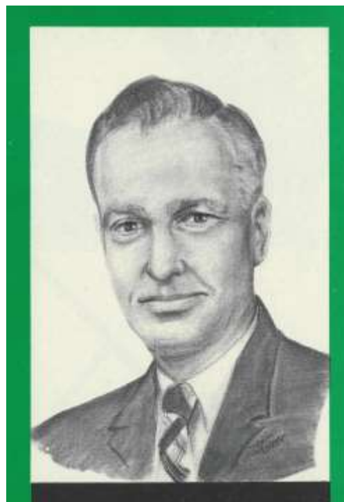
Drawing from February, 1962 National 4-H News.