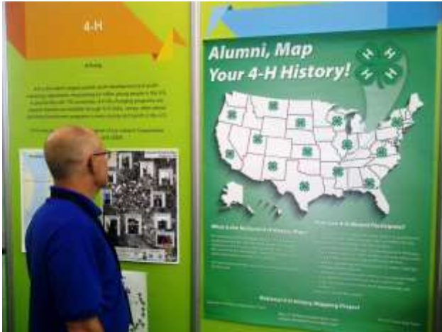
4-H Alumni attending the Esri International Mapping Conference last month were encouraged to map their 4-H History.

historical items might be posted in the states where they were members or where they live now.