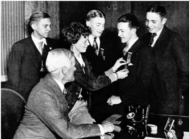
The famous aviatrix Amelia Earhart (center left) was one of the major guests and handed out awards to delegates attending the 1932 National 4-H Club Congress.

In support of the 2014 theme, the National 4-H History Preservation Program has researched and written a new segment on "Astronauts, Space and 4-H" for National 4-H History Preservation website http://4-HistoryPreservation.com/History/Space/ .